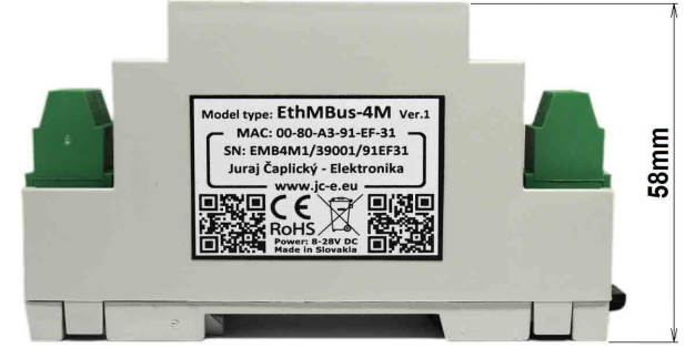
Side view with DIN rail attached