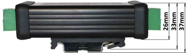
Side view with DIN rail attached