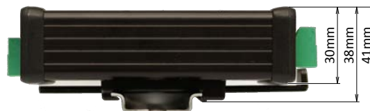
Side view with DIN rail attached