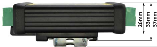
Side view with DIN rail attached